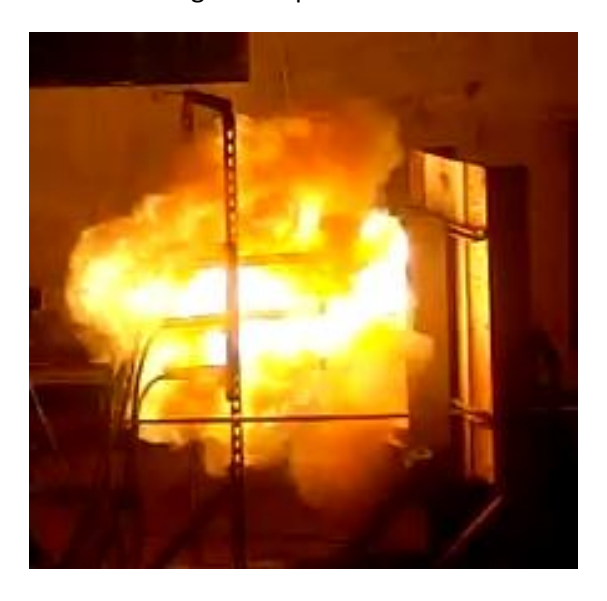
480-V multi-bank and 320-A meter sockets

Scan the QR code for a short video on arc-flash hazards on different distribution and low-voltage gear